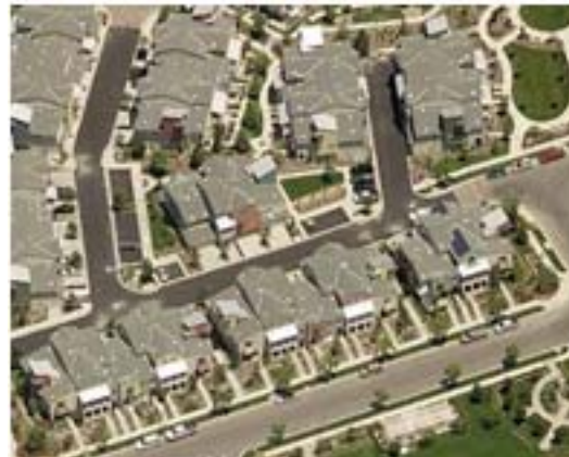
Sutter's Mill @ Ladera Ranch Ladera Ranch, CA