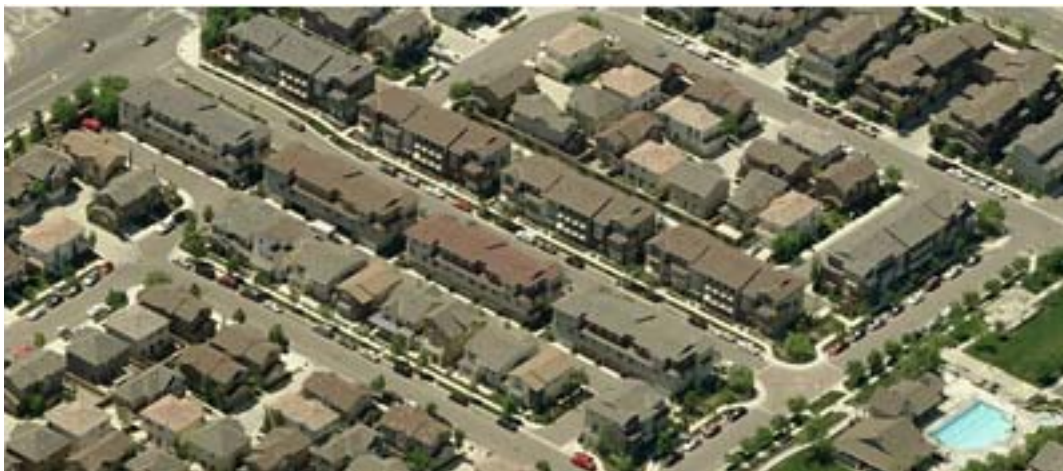
Wright's Landing @ Tustin Field Tustin, CA